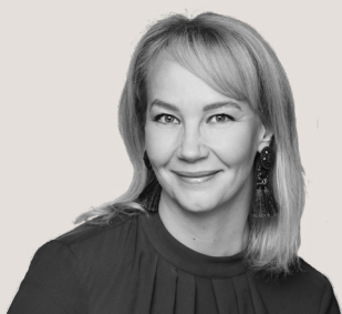
5 INKA MERO